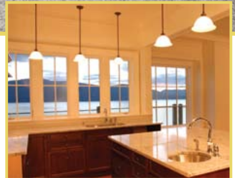
The deck and kitchen of a new 3,500 sq. ft. waterfront home on Salt Spring Island, BC.