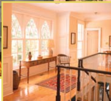
A 5,500 sq.ft. custom Colonial home in southern Ontario.