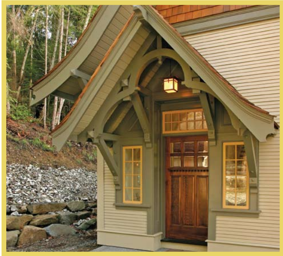
The hooded entrance to a new home built on Salt Spring Island, BC. www.sorensenfinehomes.com