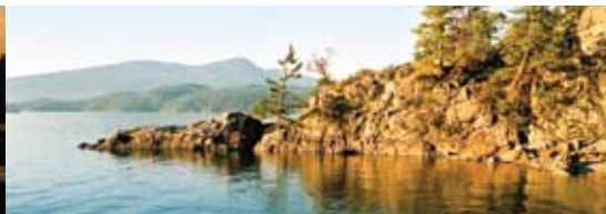
The views above are from exceptional properties being developed by Sorensen Fine Homes