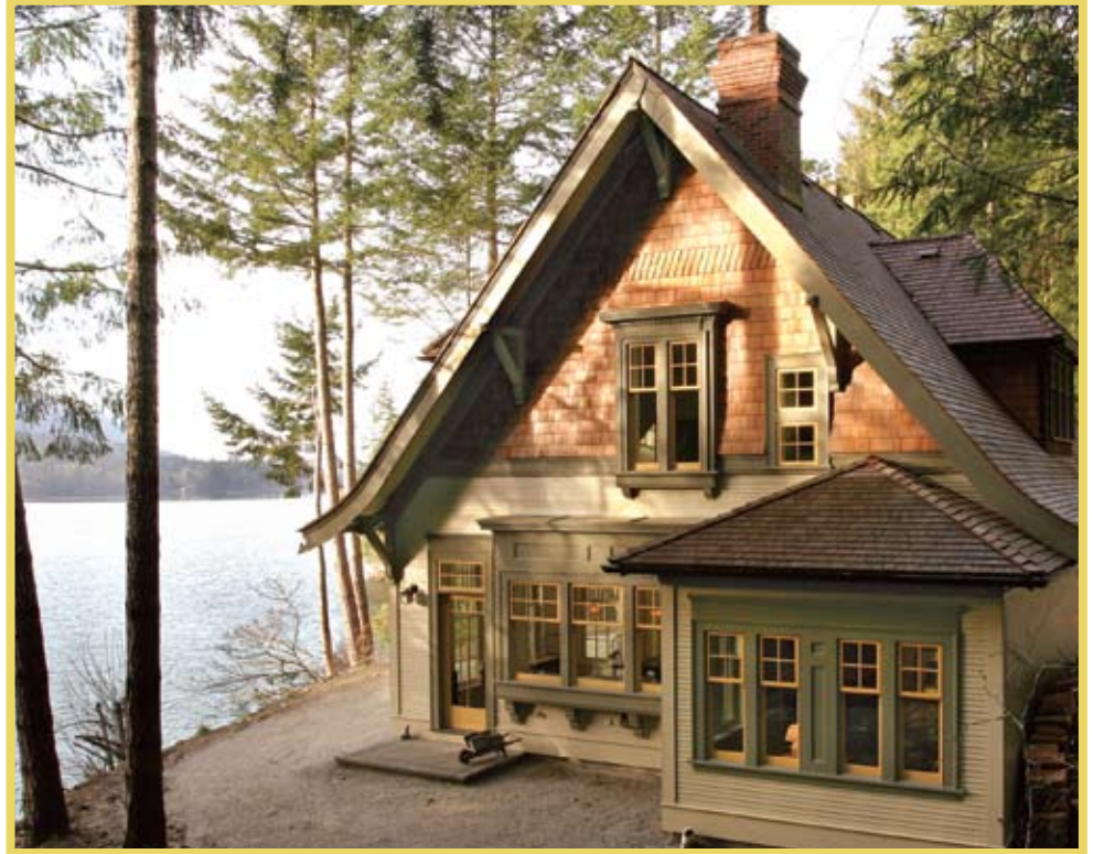
A richly detailed home designed and built by Sorensen Fine Homes on Salt Spring Island, BC.